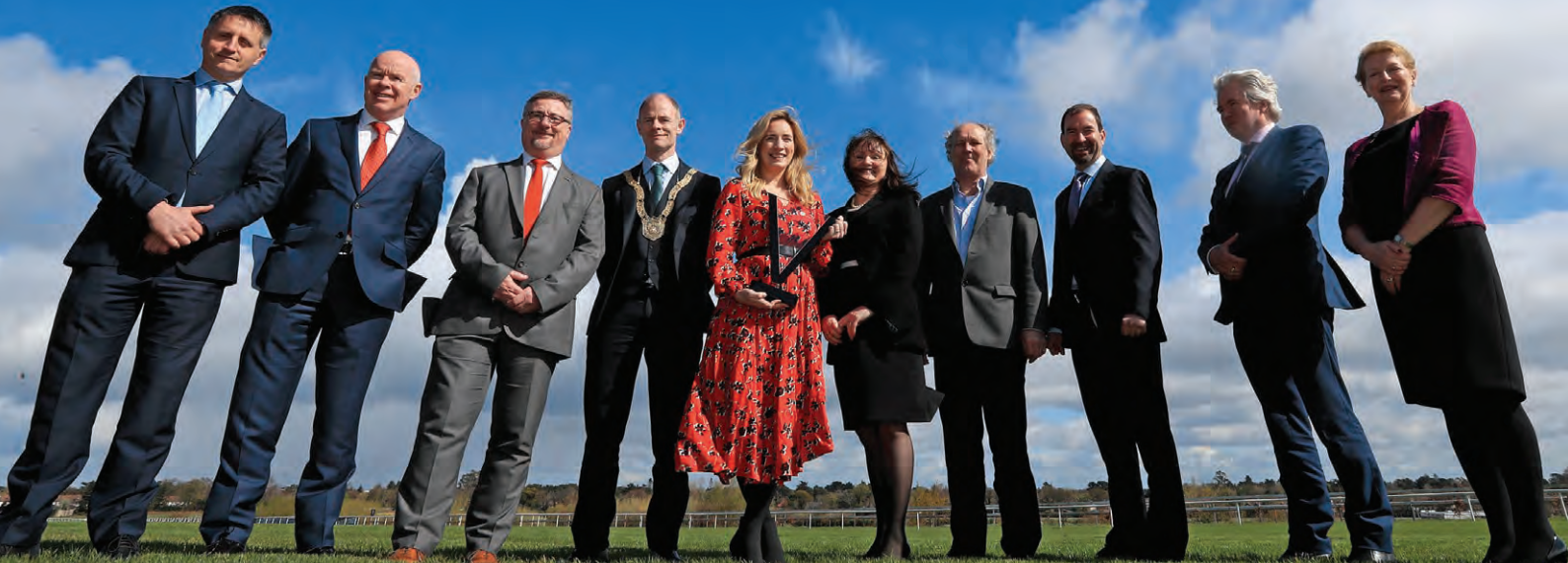
Awards 2019 launch